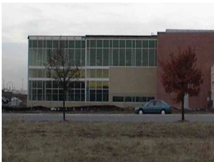
Erin Meadows Multi Use Complex on Erin Centre Boulevard

Between 1995 and 2000 a total of 676 building permits were issued for new non-residential construction, with a total prescribed value of $2.4 billion. Of these permits